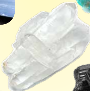
Clear Quartz – above.