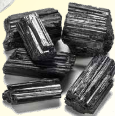
Black Tourmaline – below.