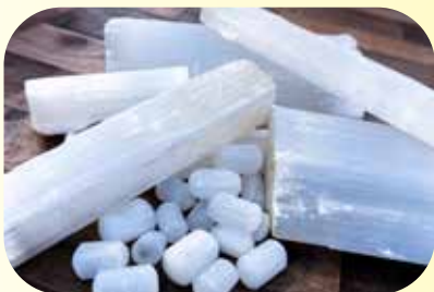
Selenite – above.