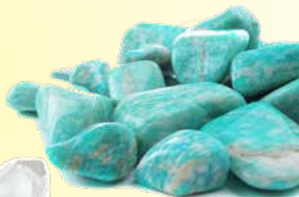
Amazonite – above.