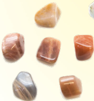
Moonstone – below.